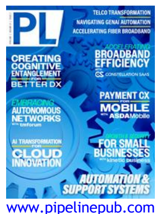
Volume 21, Issue 7